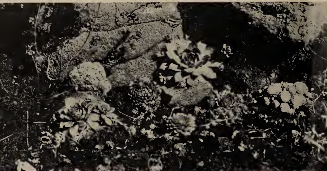
Sempervivums—Tectorum, Arachnoideum, Soboliferum, Braunii, Laggerii, Rubicundum Hybridum, Albertii.